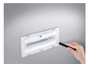
Laser pointer testing